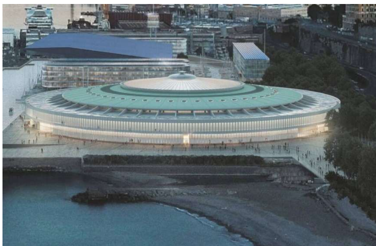
Hall of finals

Address: P.le John Fitzgerald Kennedy, 1 16128 Genova GE Italy