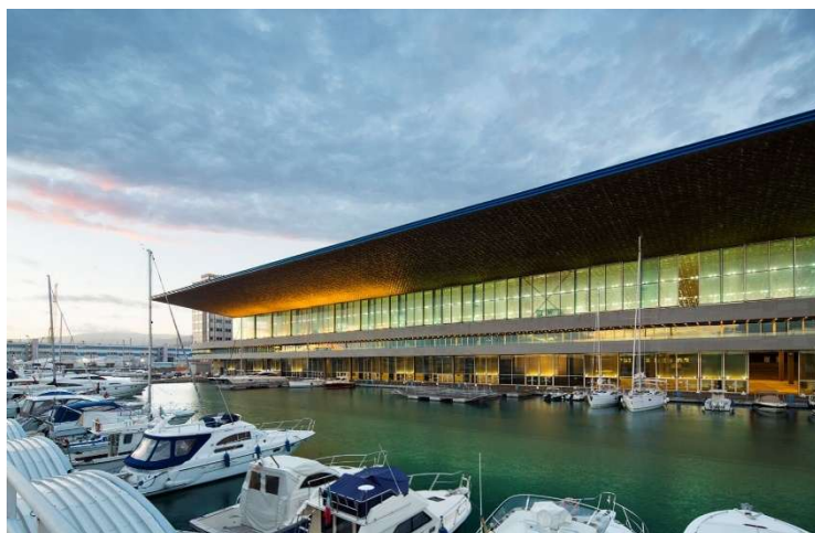
Hall of preliminaries

Address: P.le John Fitzgerald Kennedy, 1 16128 Genova GE Italy